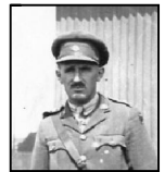
Spouse: Millar BUZZARD