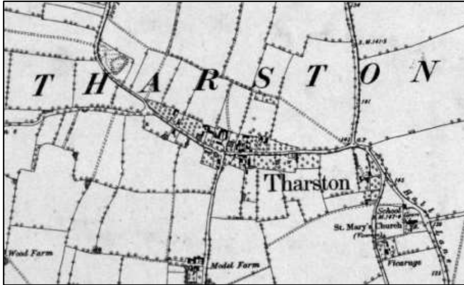
OS First Edition Six-inch to the mile