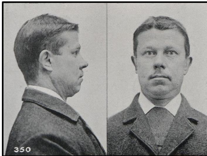
Convict photograph (circa 1912 aged 32)