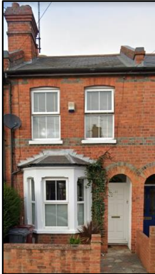
31 Chester Street, Caversham (c.2022)