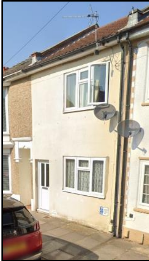
84 Ranelagh Road, Portsmouth (c. 2022)